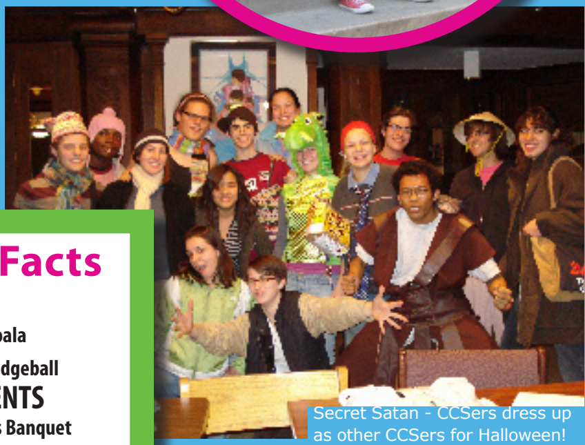
Secret Satan - CCSers dress up as other CCSers for Halloween!