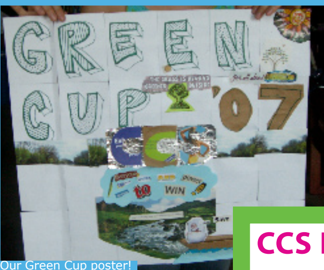
Our Green Cup poster!