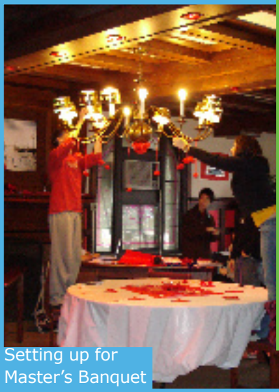
Setting up for Master's Banquet